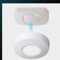
Ceiling mount cover