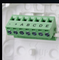
Adjustable terminal block