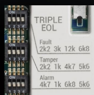
Built in EOL resistors