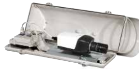
VERSO HI-POE IPM + CAMERA