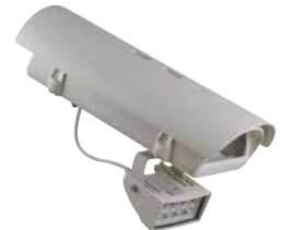
VERSO HI-POE IPM + GEKO IRH